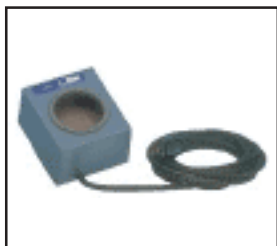
"Secondary" controllers can be added that enable alternative access methods. For example using a single finger