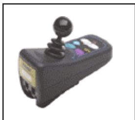
A standard "Dynamics" joystick controller

The Wise:DX is a system that can be added to a powered wheelchair with a "Dynamics" electronic system to enable a person to drive with a joystick, switches or alternative specialty controller, and also control over devices such as a computer or household appliances using the same access method (eg. joystick, switches).