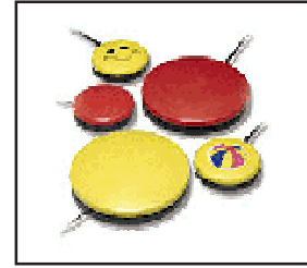
Up to a maximum of 6 switches

The Wise:DX system is extremely adaptable and can be altered over time to meet a person's changing needs, often without any need to change the electronic set-up. The large degree of flexibility within the Wise:DX system is a dream come true for anyone working with assistive technology. The system was designed to be operated jointly by rehabilitation/health professionals and their clients.