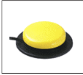
A single switch