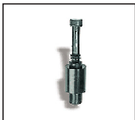
A variety of joysticks are available that can be used that act as a 4 or 5-way switch